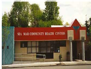
Sea Mar's South Park medical clinic

In 2007, Sea Mar Community Health Center provided 400,000 medical visits to 97,000 patients.